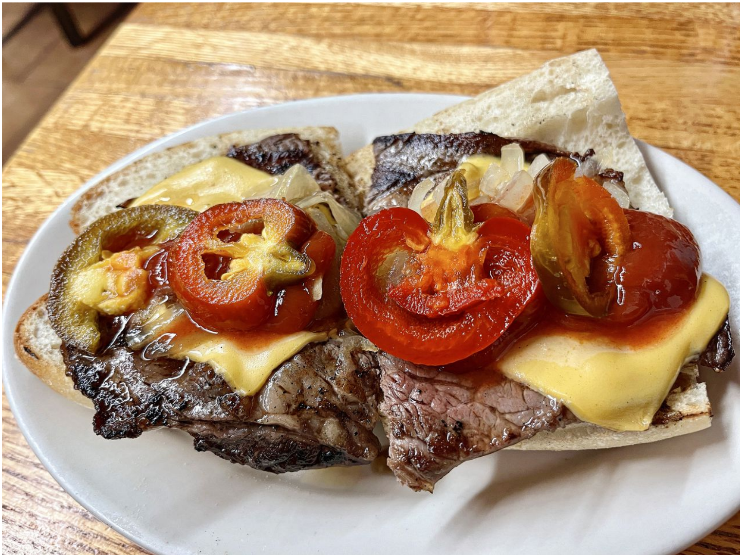
A Cheesesteak from Piccolo's in Hoboken.

Updated: Jan. 02, 2023, 7:04 a.m. | Published: Jan. 02, 2023, 7:00 a.m.