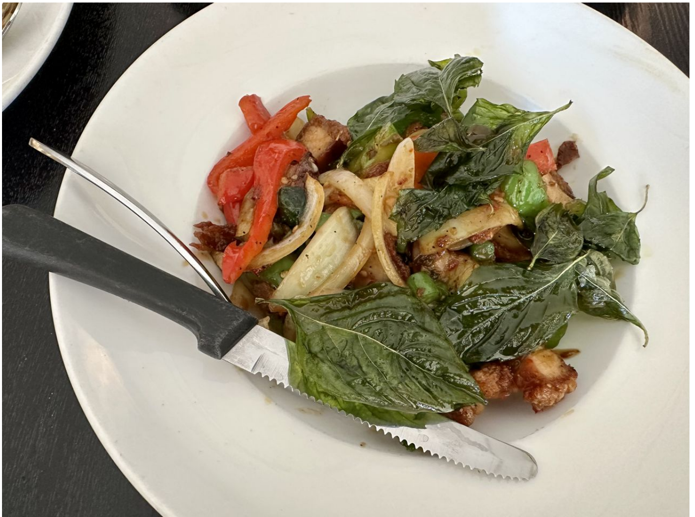
Basil pork belly at Maya Thai Eatery in Westfield