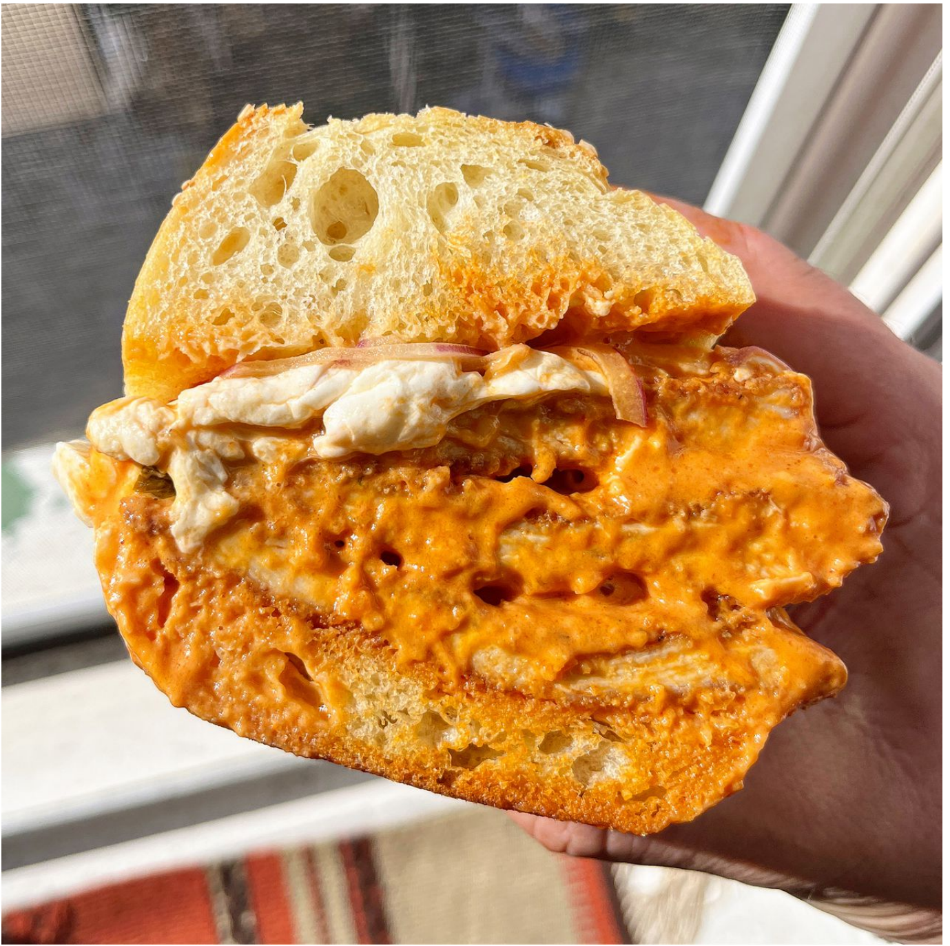
A Vodka parm sub from Veloce in Jersey City.