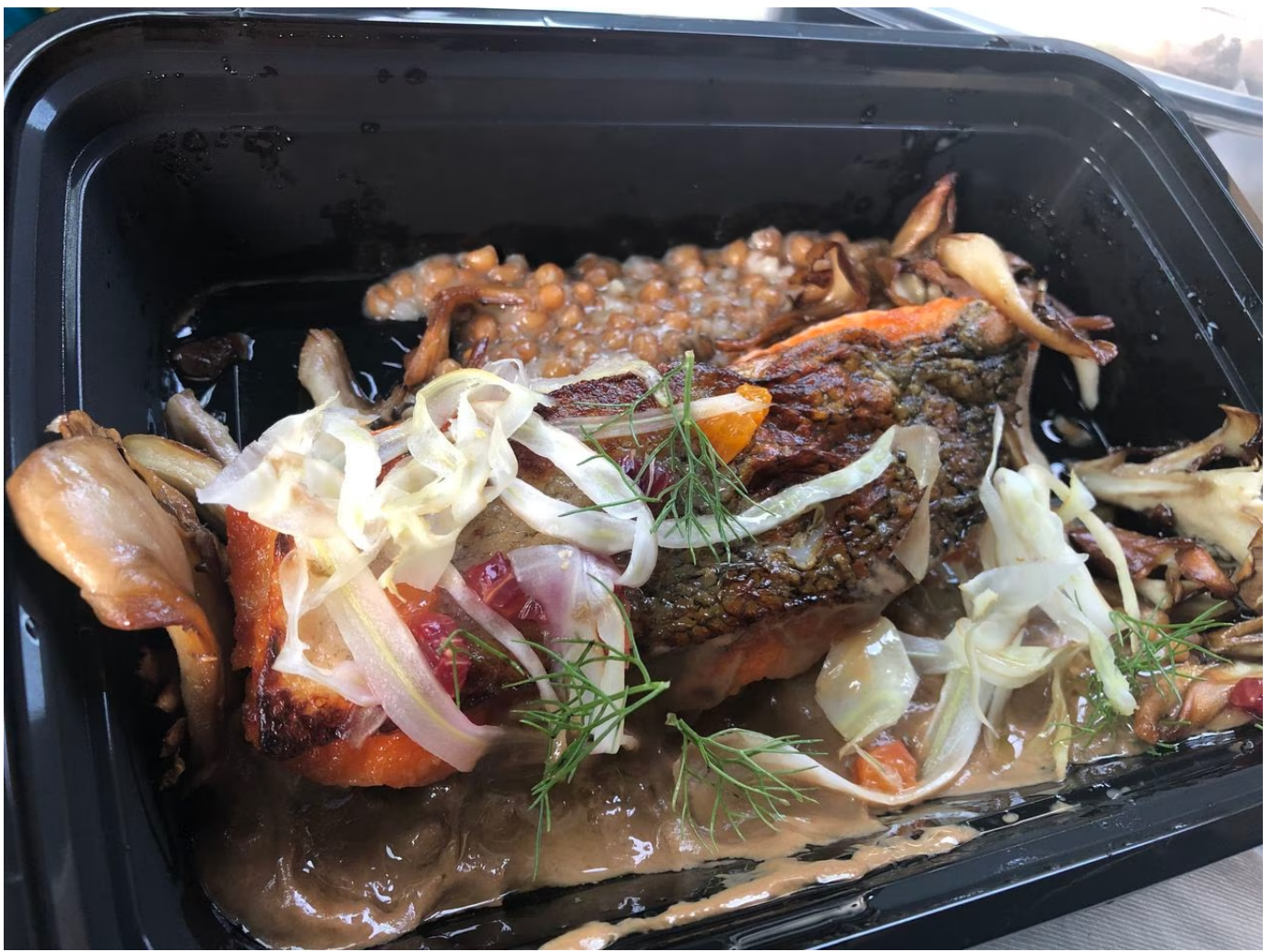
Ora King salmon, The Circle, Fredon