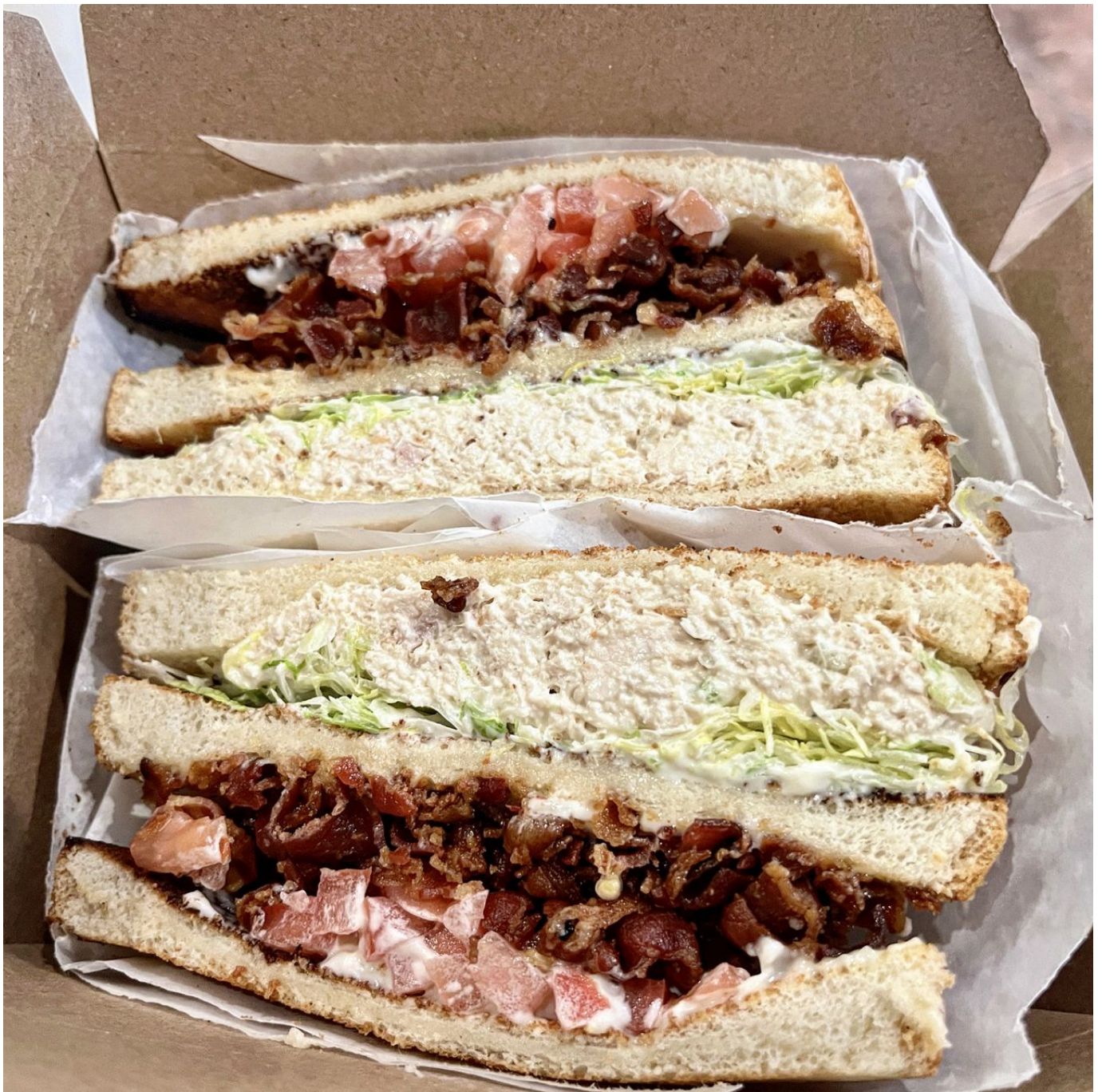
A chicken salad club sandwich from Bagels by Jarrett in West Orange.