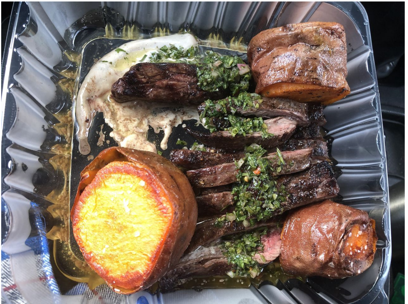
Skirt steak, The Arlington, Ship Bottom