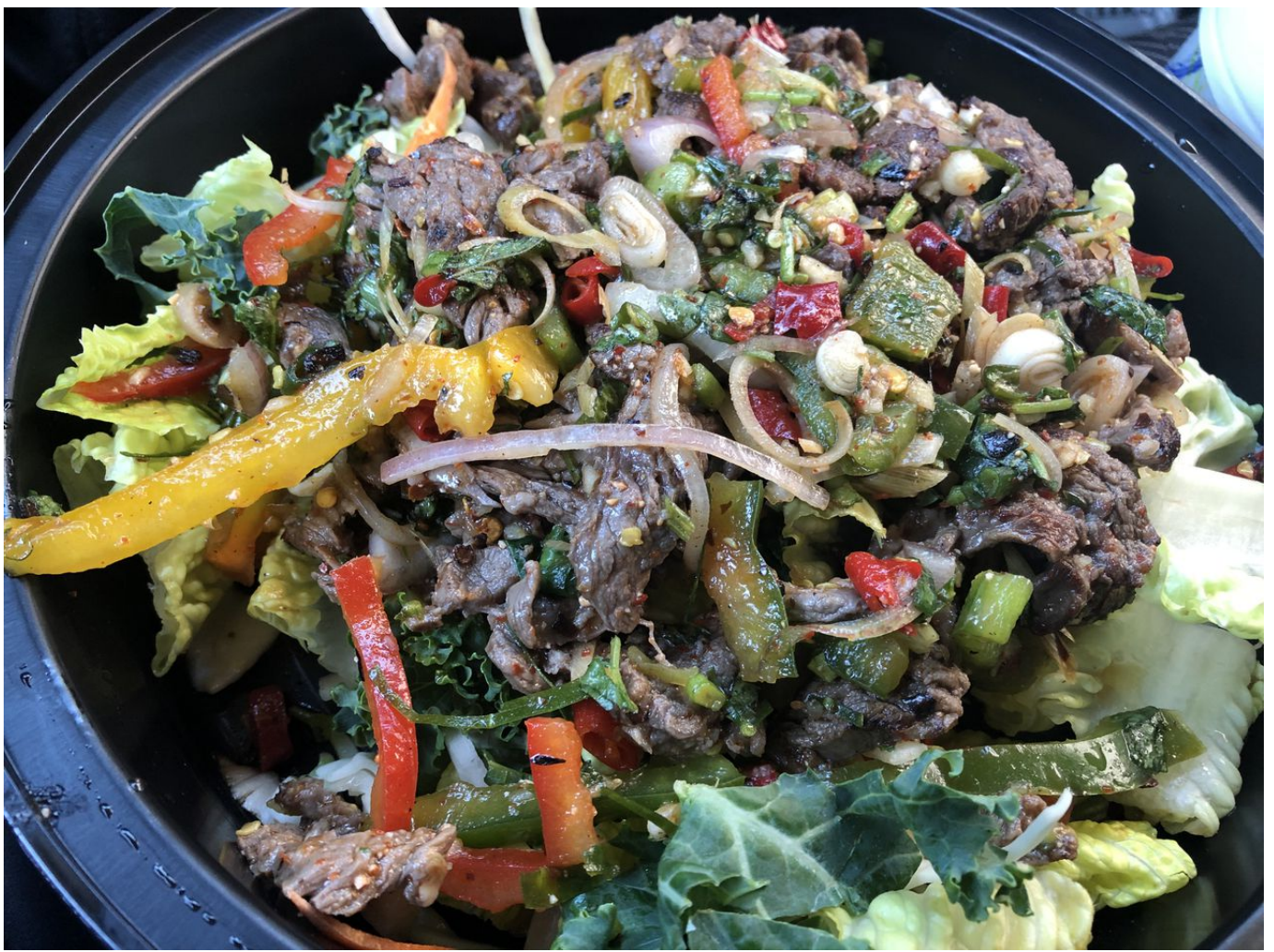
Pepper beef salad, Bamboo Leaf, Bradley Beach