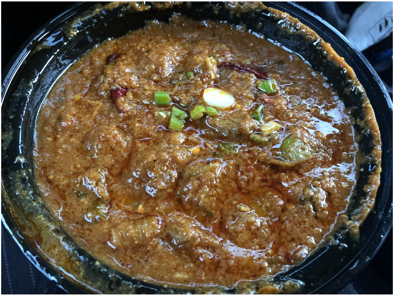
Lamb kashari, Spicy Affair, Swedesboro