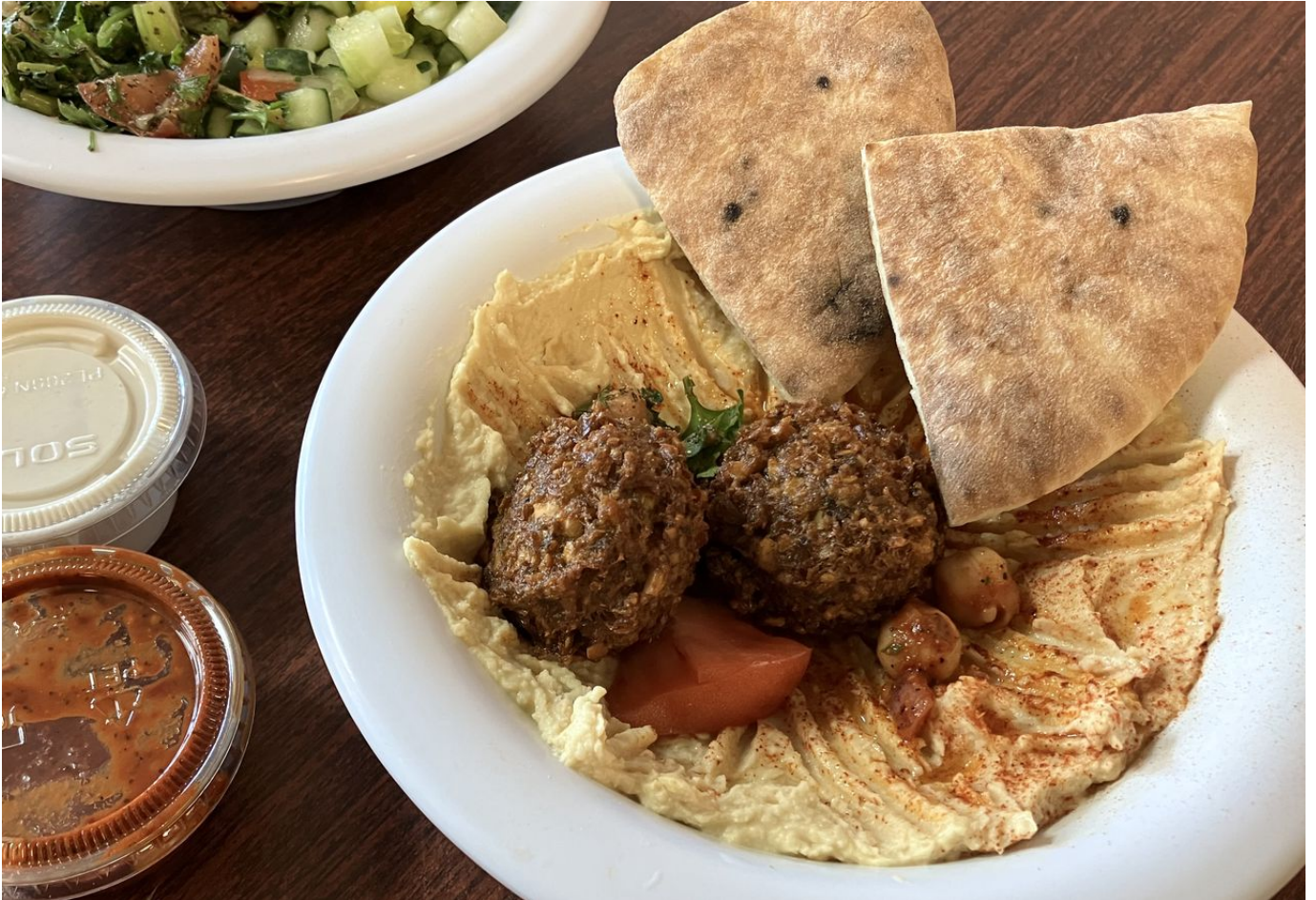
This falafel plate was loaded with the aroma and flavor of cardamom. Karim Shamsi-Basha

There may be no food more synonymous with diners than disco fries, and there may be no better diner in New Jersey than Tops . So it should be no surprise their take on the dish is absolutely marvelous. A mountain of cheesy fries served with gravy on the side so you can theatrically top them with the delicious savory goodness yourself. (JS)