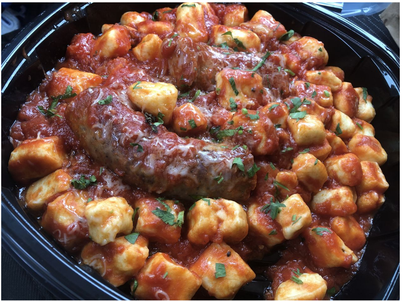
Gnocchi, Di Paolo's, Penns Grove