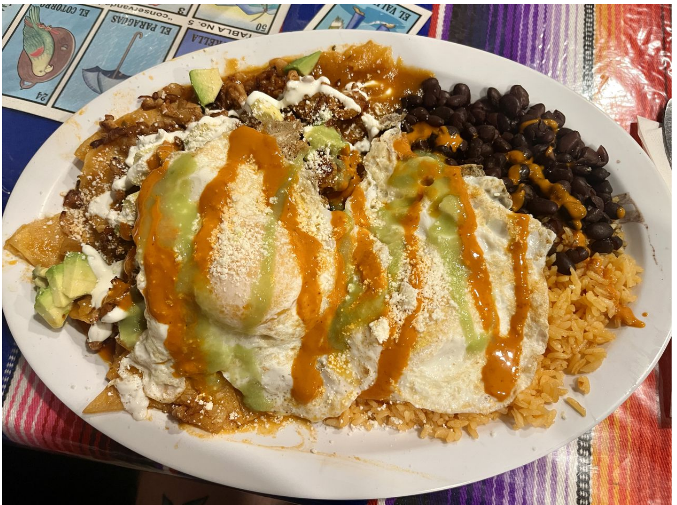
Chilaquiles from El Rancho Taqueria in Jersey City.