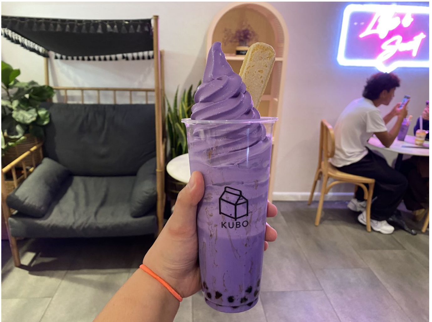
Ube Soft Serve at Kubo Coffee and Creamery in Nutley, NJ.