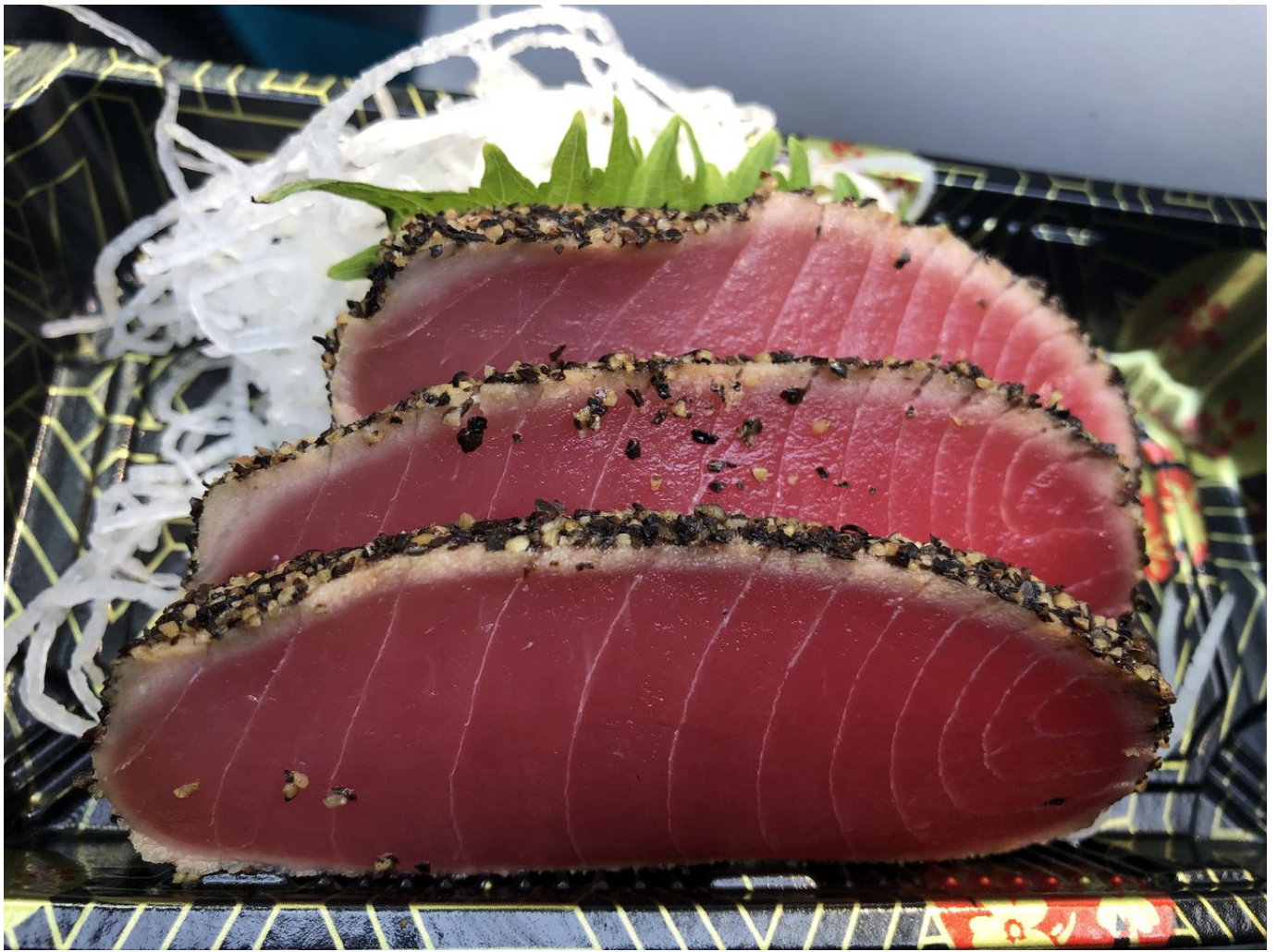
Pepper tuna, Jing's Sushi House, Burlington