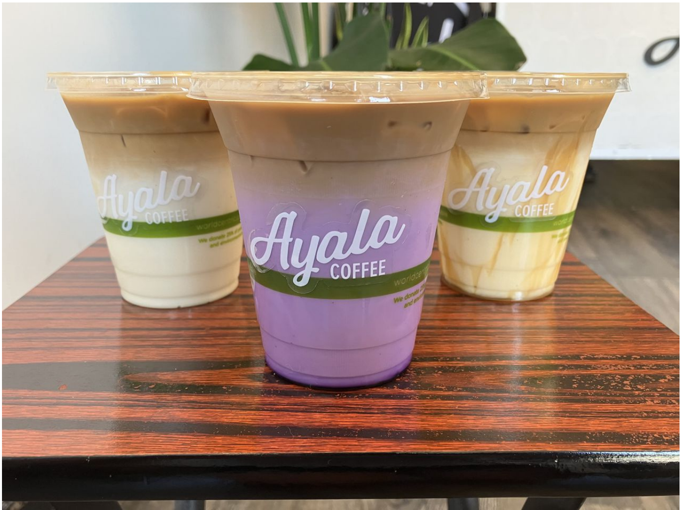
The cassava, ube, and leche flan drink from Ayala Coffee in Union, NJ.