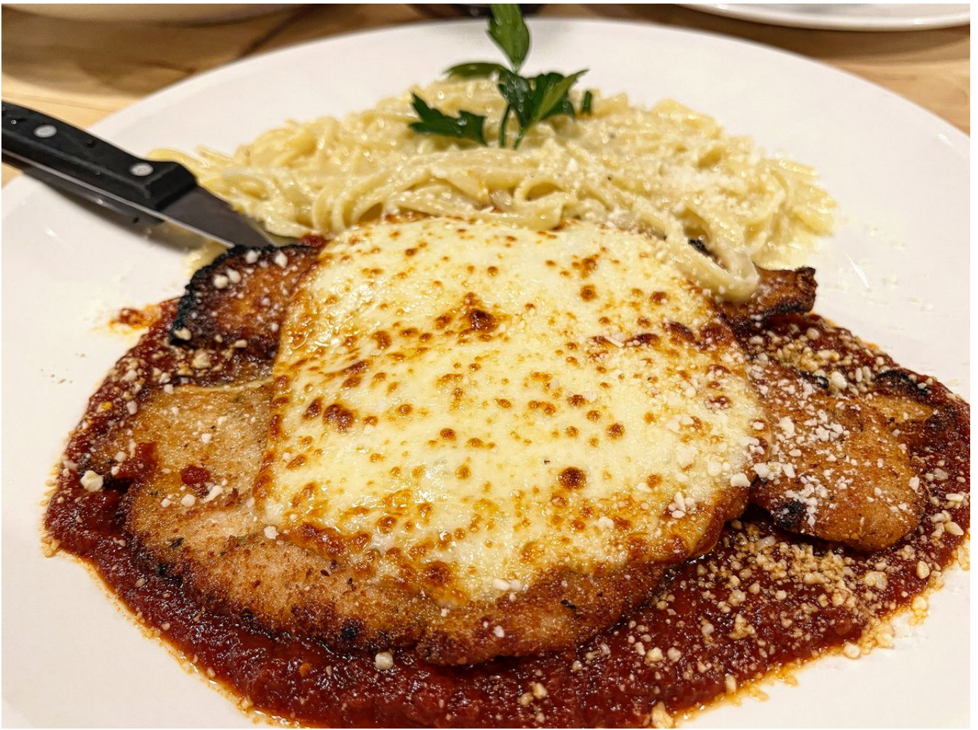
Chicken parm from The Pasta Shop in Denville.