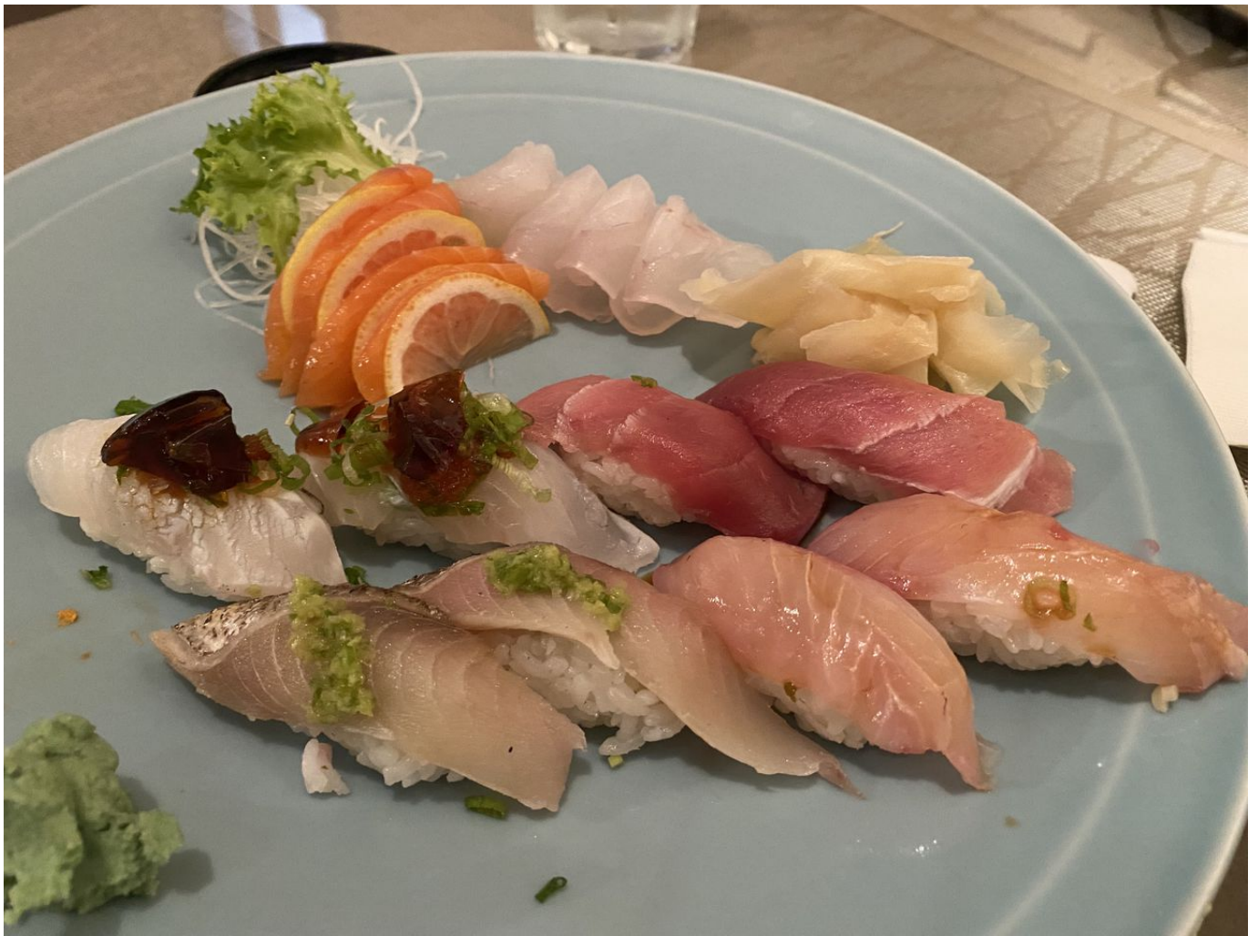
Assorted sushi, Ai Sushi, Somerville