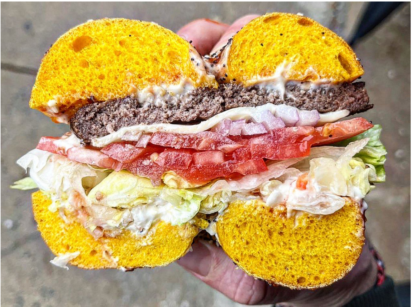
A bagel burger from Bagels n' Cream in Robbinsville.