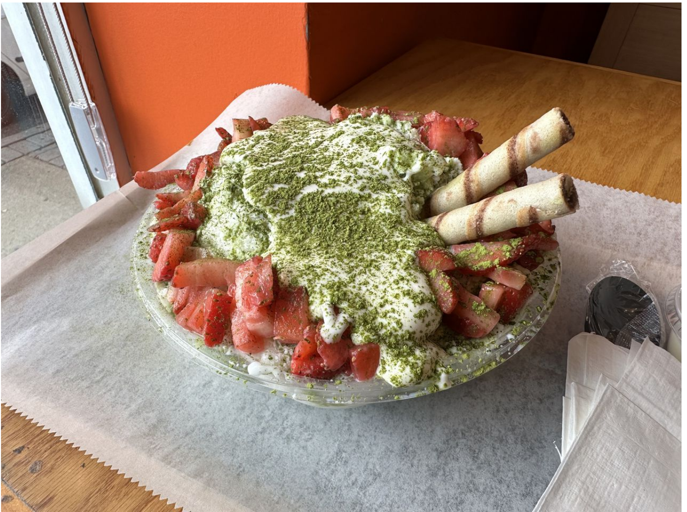
Green Tea Strawberry Bingsoo from Cafe Leah in Palisades Park, NJ.