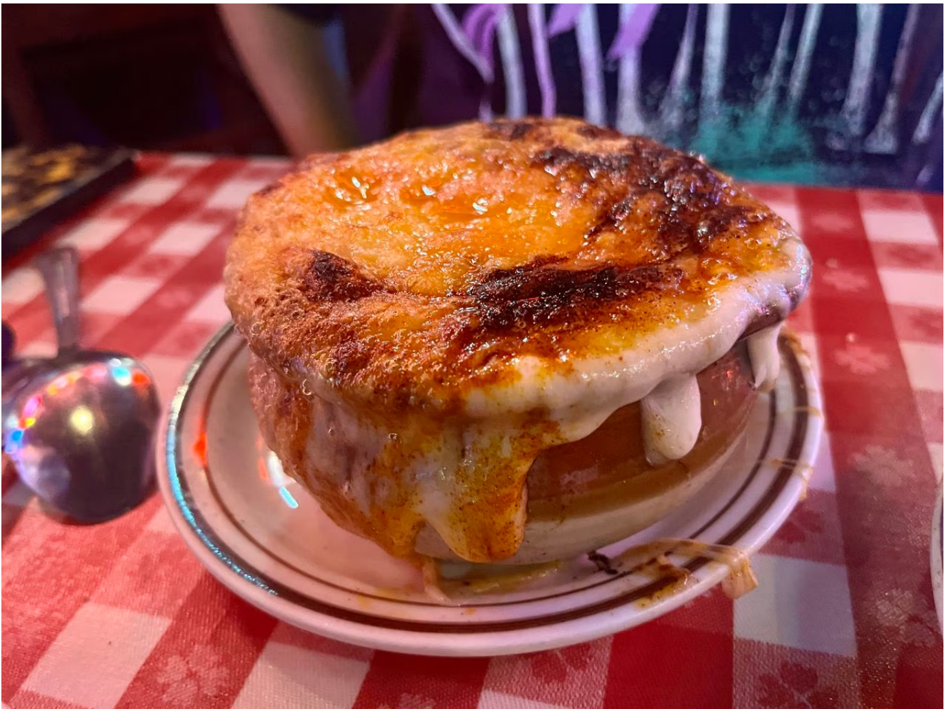
French onion soup from Arthur's Tavern, Morris Plains.