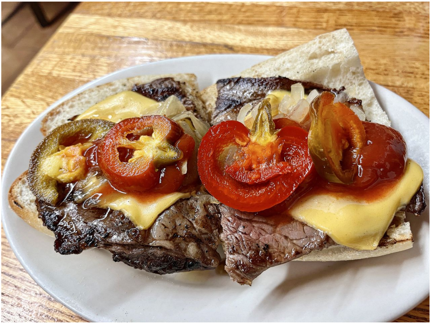
A Cheesesteak from Piccolo's in Hoboken.