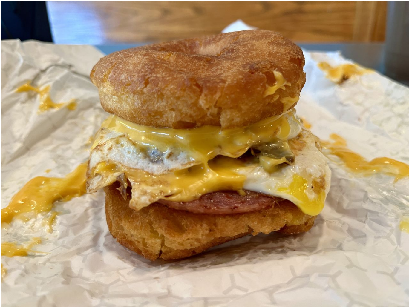
A Taylor ham, egg and cheese sandwich on two doughnuts from Top That! Doughnuts in Rutherford.