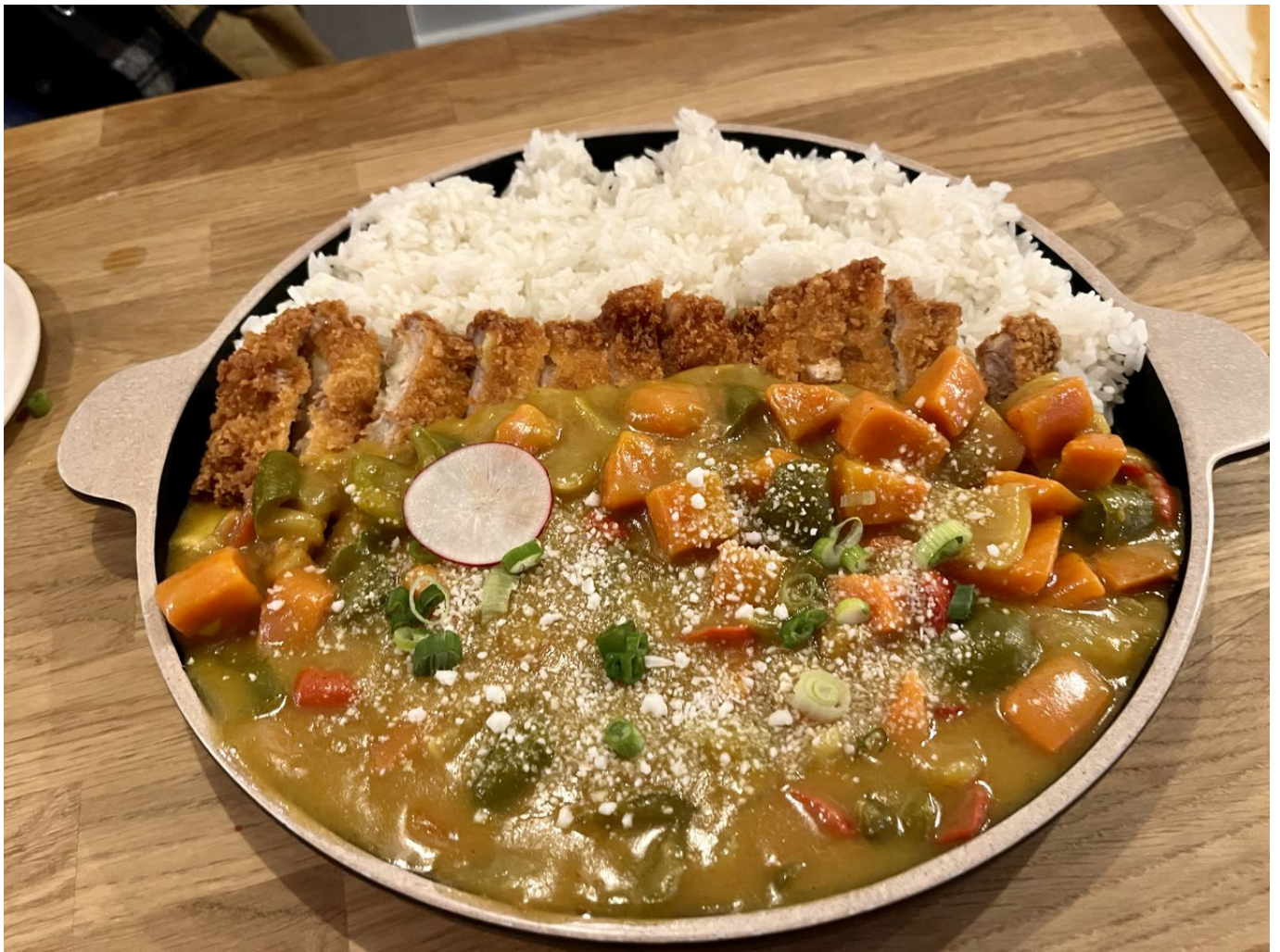
Akiko chicken katsu curry from Blue Spice Kitchen in Hamburg.