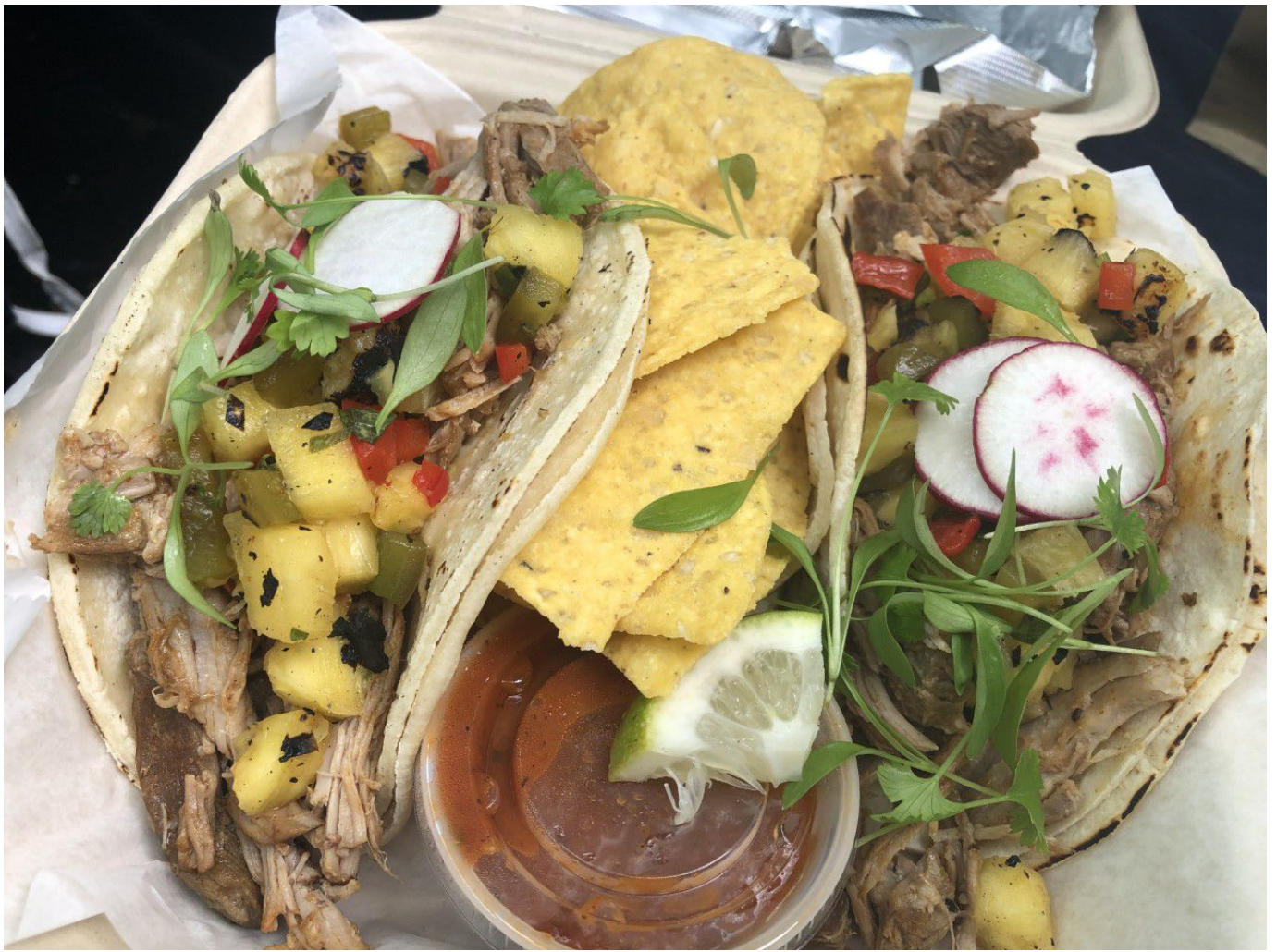
Tacos, El Capitan's Taco Shack, Lower