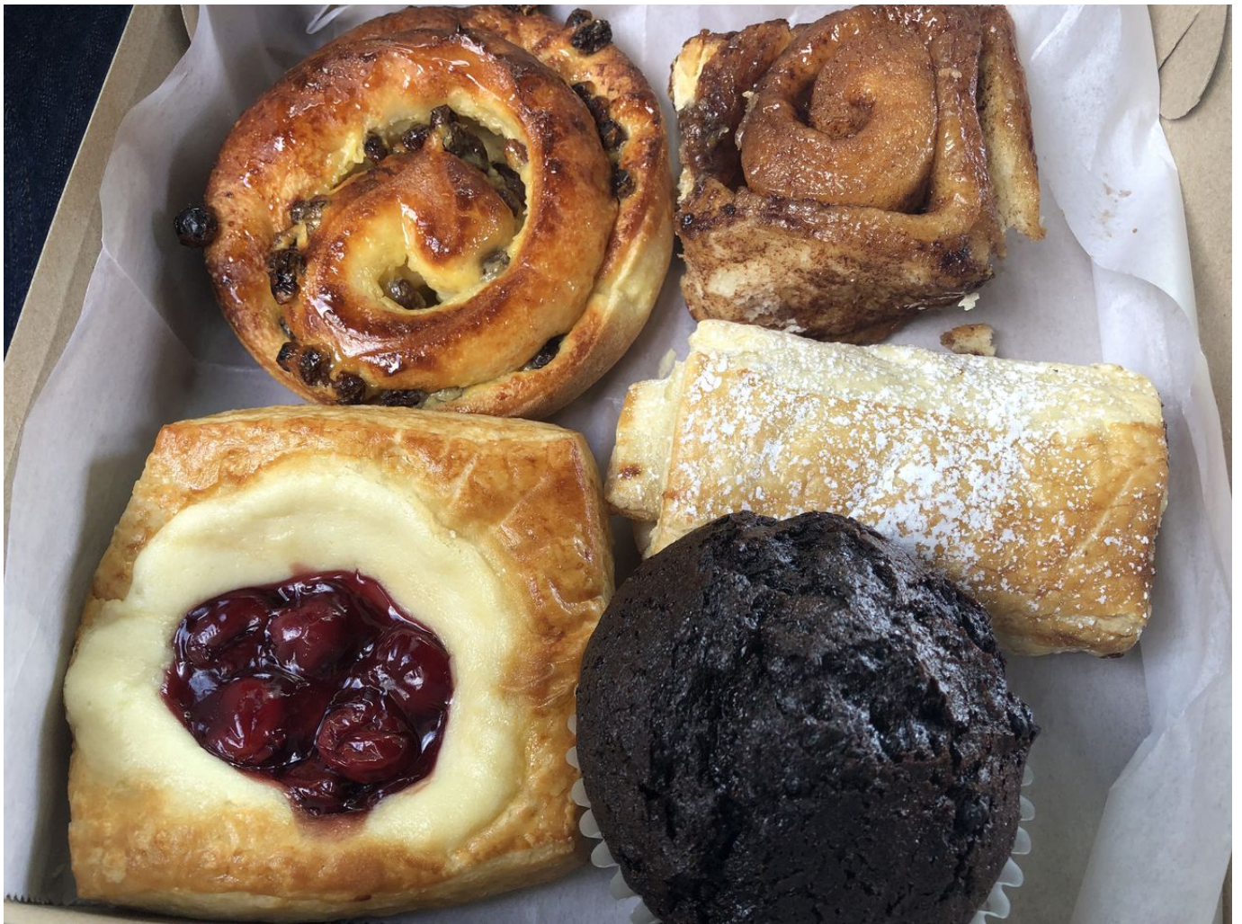
Pastries, Chez Michael, West Cape May