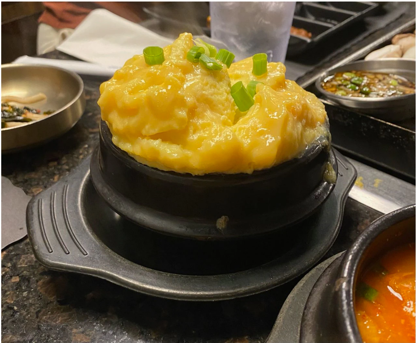
Steamed Egg at Taste 1080 in Fort Lee, NJ.