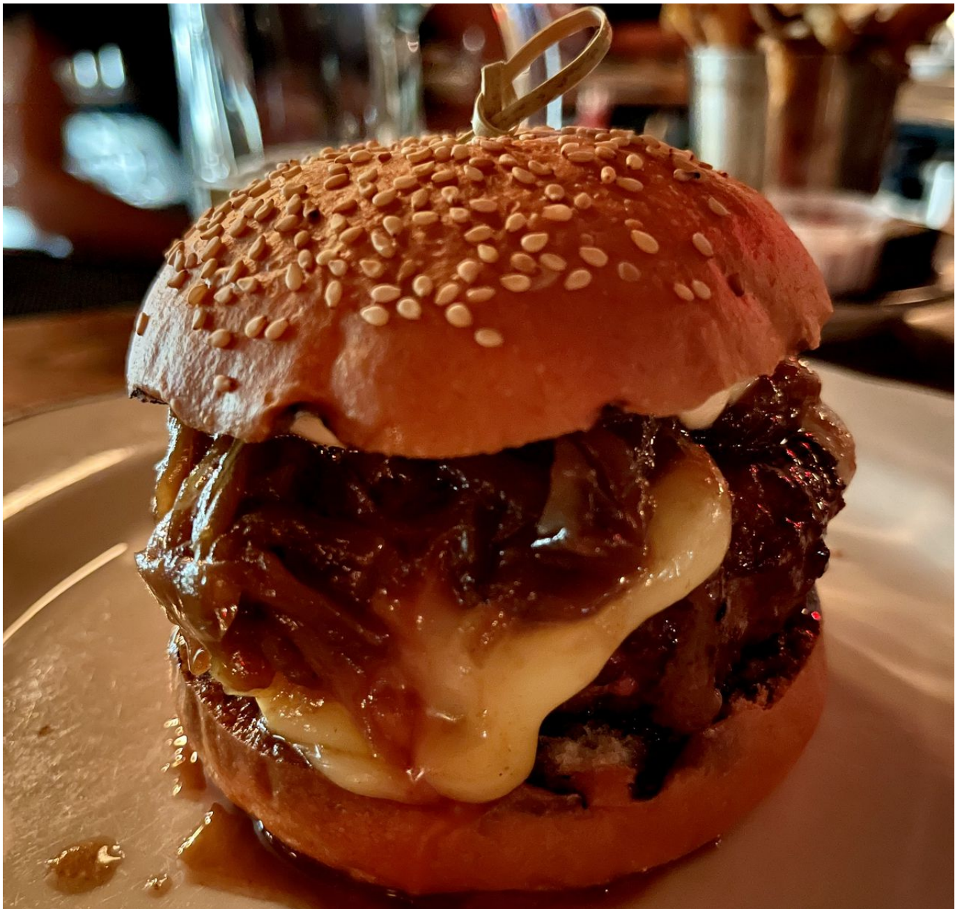
The Burger from Grand Tavern in Neptune.