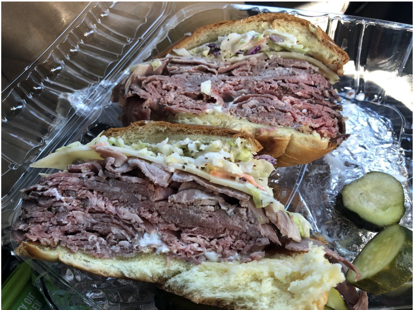
The Blado, Water Dog Smoke House, Ventnor