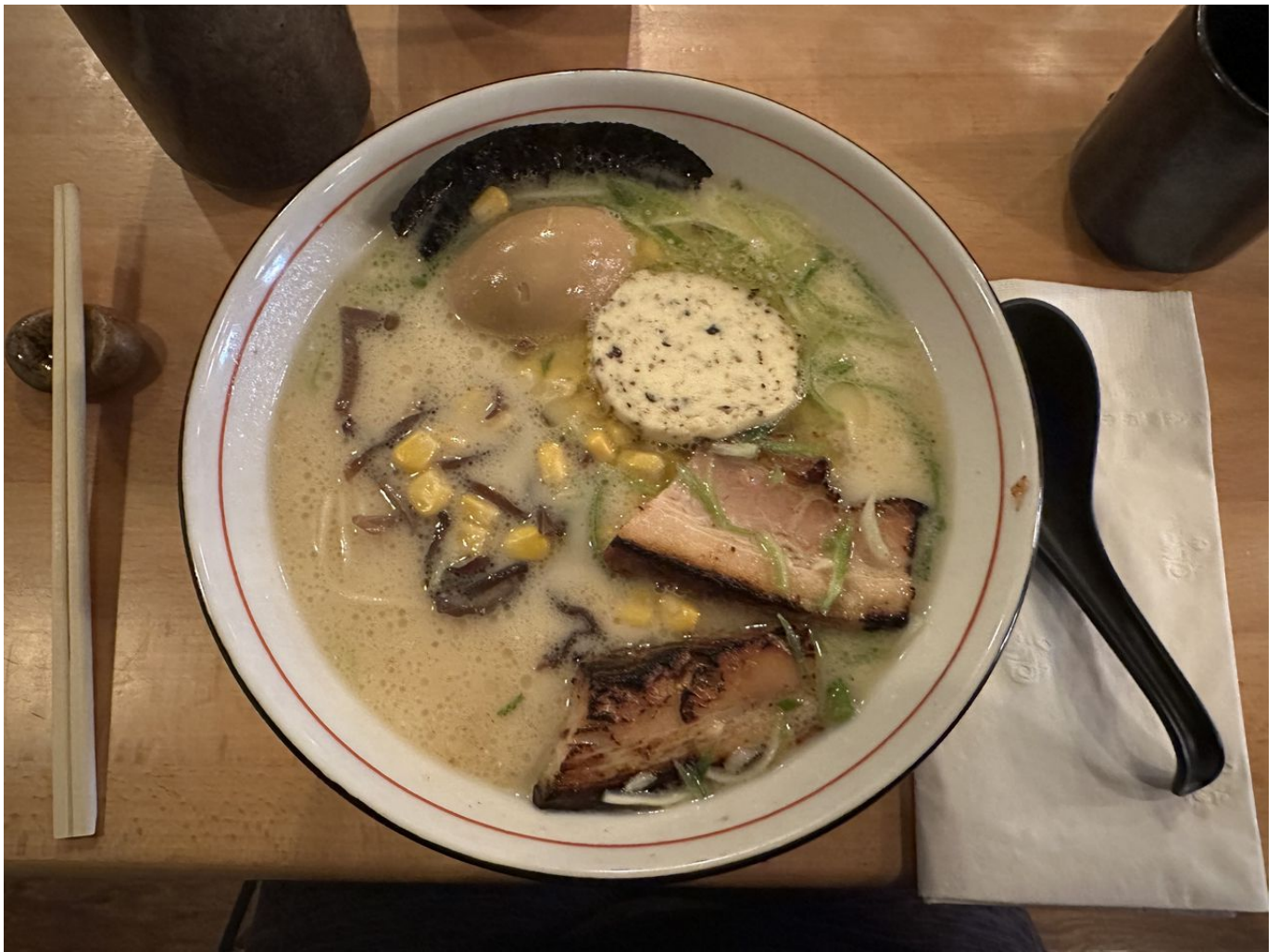
Truffle Butter Ramen at Ramen Nagomi in New Brunswick, NJ.