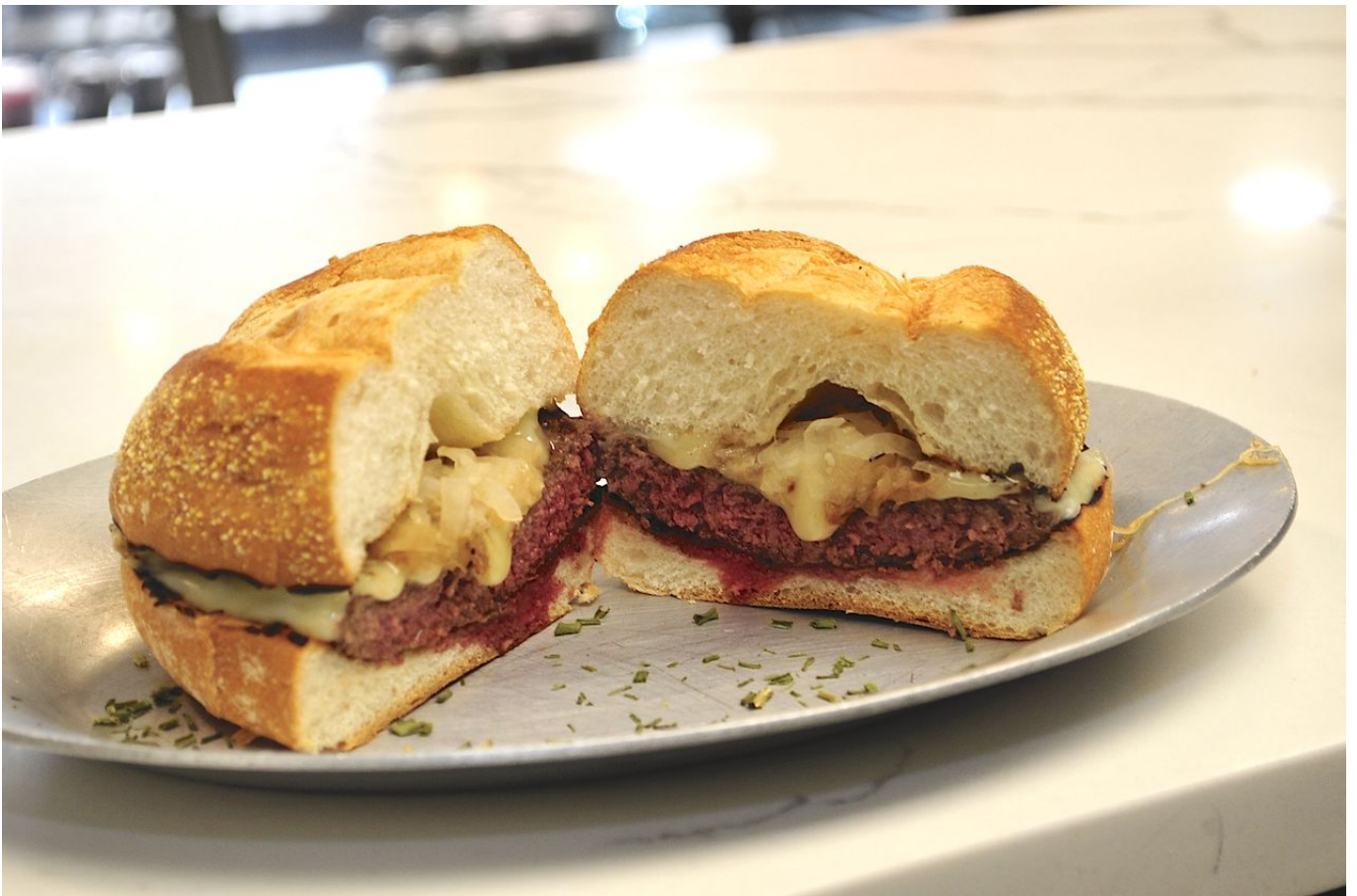
This camel burger was the closest in taste to Wagyu beef.