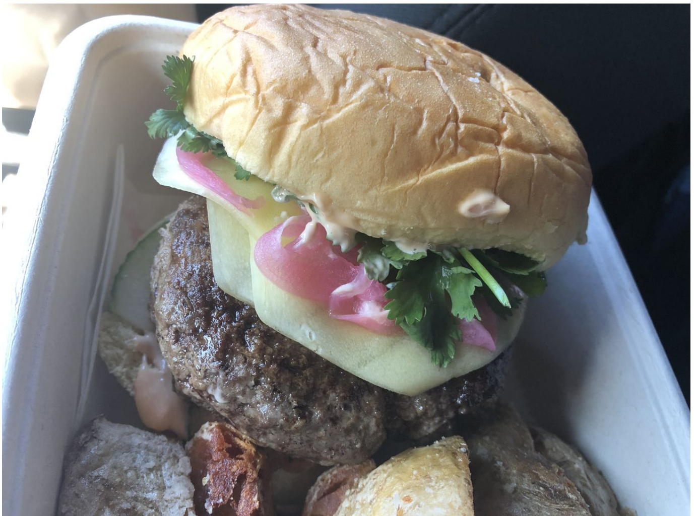
Banh mi burger, Juniper Hill Restaurant and Bar, Annandale

Banh mi burger, Juniper Hill Restaurant and Bar, Annandale