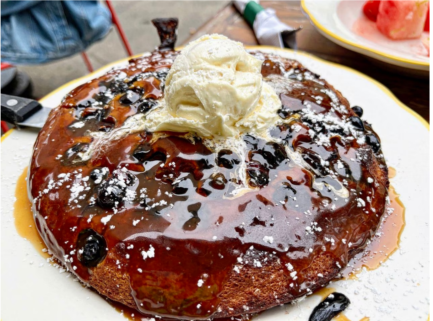
The blueberry skillet cake from Cardinal Provisions in Asbury Park

Juniper Hill was once a PNC Bank; you can even dine in the vault. You can take this to the you-know-where: The banh mi beef burger, with Happy Valley beef, spicy mayo, pickles, mango, mixed herbs and thick Kennebec potato fries, is outstanding. If I made a new list of the state's best burgers , it would be in the top 10. (PG)