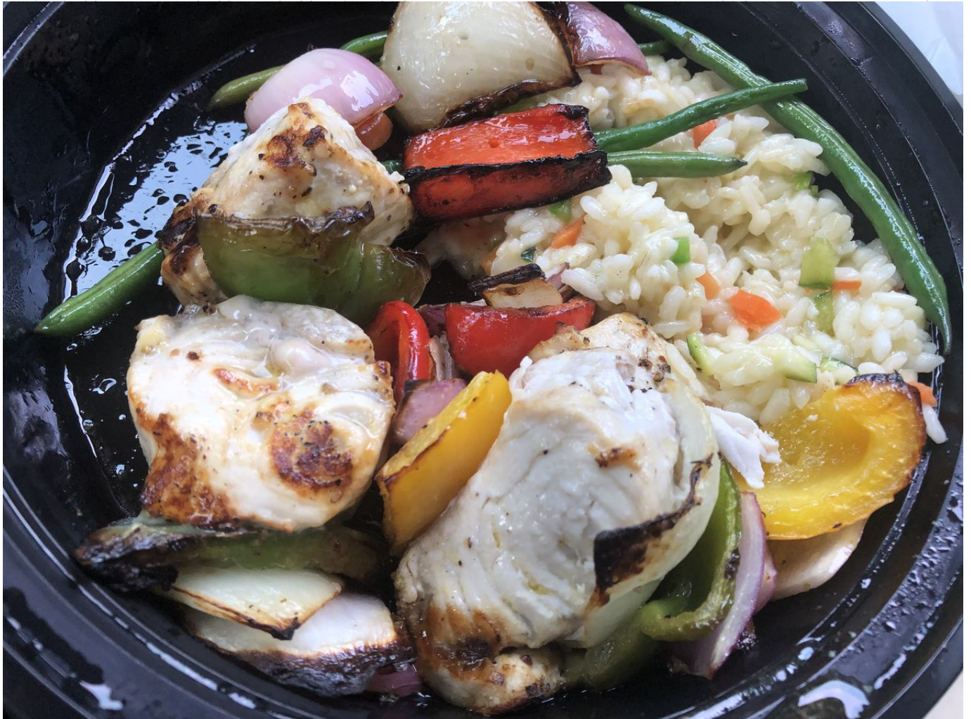
Swordfish, Oceanos, Fair Lawn

It was hard to not walk out of this international bakery with a bag full of pastries. The best of the bunch was the massive chocolate hazelnut baklava. It was stacked with beautifully golden, flaky layers of phyllo dough, hazelnuts and a smooth spread of chocolate. The baklava was nutty, sweet and decadent.