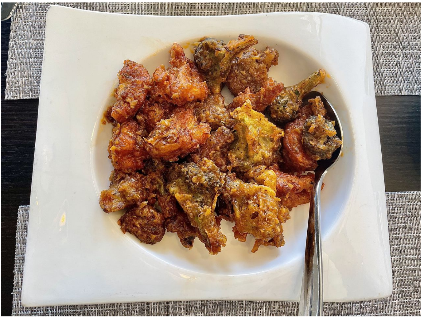
Assorted Manchurian at Paheli Indian Cuisine in Wayne