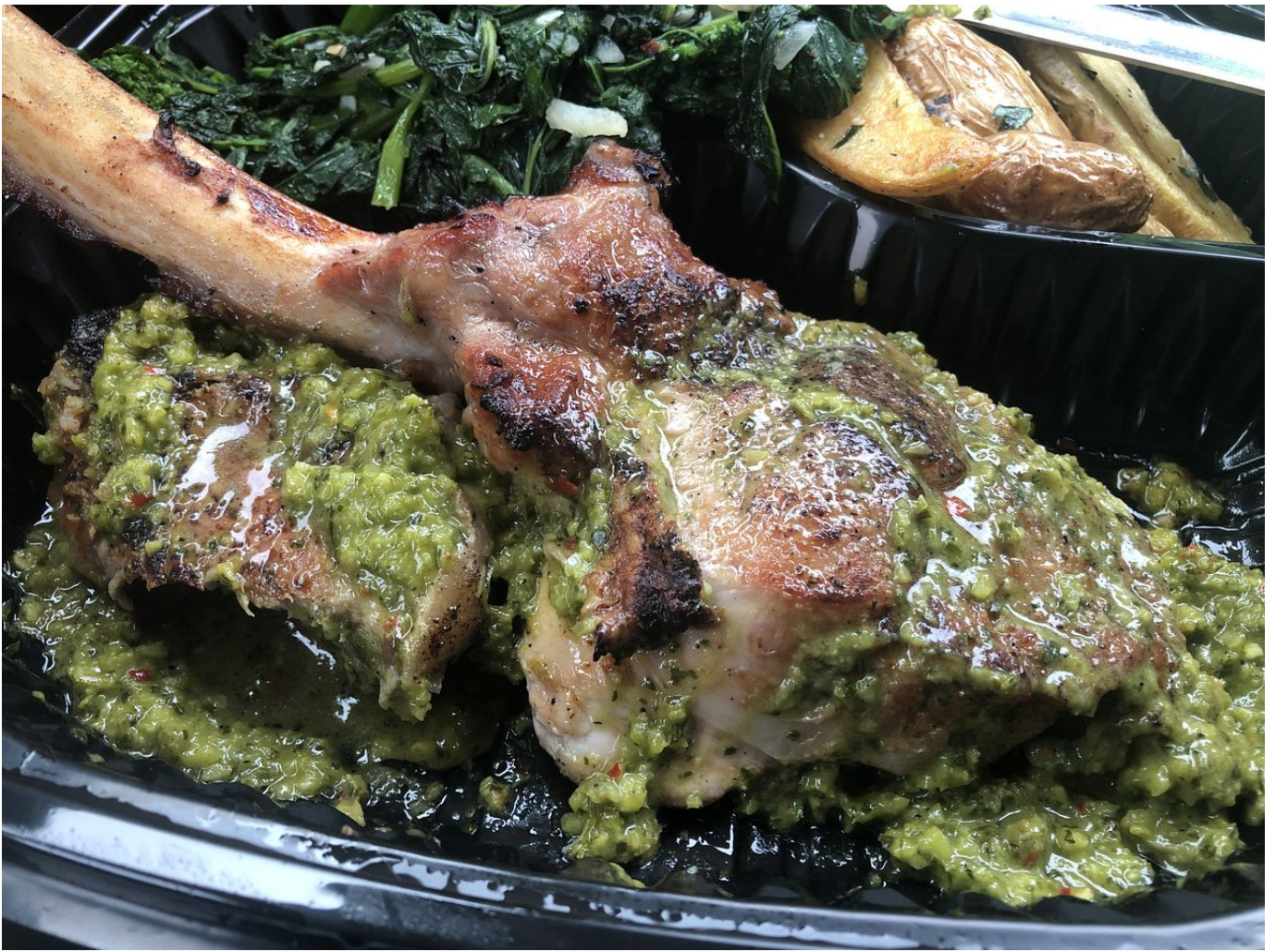
Bone-in veal chop, Botto's Italian Line, Swedesboro