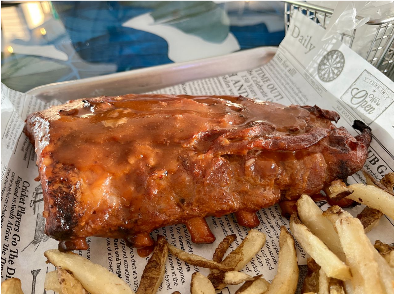
Ribs from Obal's Inn in Bloomfield.